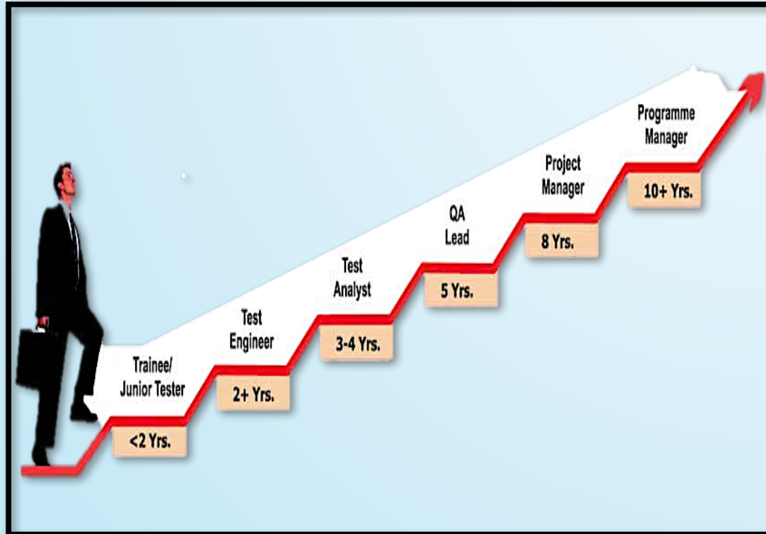
Career Growth Curve