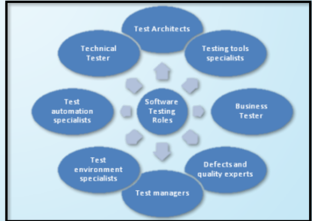
Various Software Tester roles